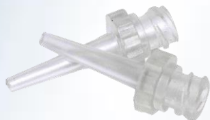
Regular Ear Tips